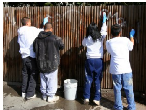
CADC complies with Title VI and VII of the Civil Rights Act